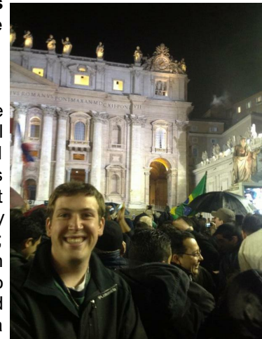
S.Patzke in Rome

Two Words: Pope Francis. I had the good fortune of studying in Rome during the resignation of Pope Benedict XVI, the papal conclave, and the election of Pope Francis. I stood in Saint Peter's Square for seven hours waiting for smoke; and when, shortly after it billowed, Pope Francis appeared on the balcony He bowed and asked all of us to pray for him; and the world went silent. Small gestures such as these are characteristic of Papa Francesco and are exactly what our individualized and egotistical world needs. It is what I need as a young-adult Catholic in 2013. Why? It is simple. Pope Francis is trying to follow the teachings of Christ as closely as he can. He calls humanity